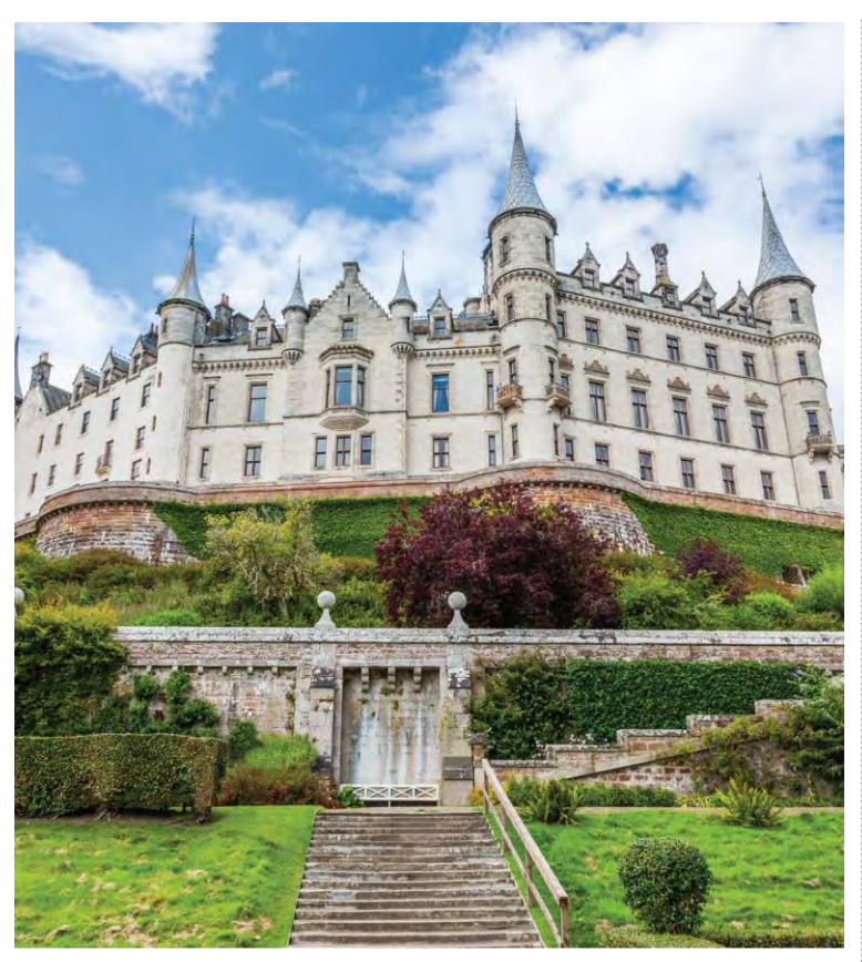
10 Days ● 14 Meals : 8 Breakfasts, 6 Dinners

HIGHLIGHTS... Bagpipe Lesson, Whisky Distillery, Isle of Skye, Armadale Castle, Loch Ness, Orkney Islands, Dunrobin Castle, Sheepdog Demonstration, St. Andrews, Choice on Tour, Edinburgh Castle, Scottish Cooking Experience, Royal Edinburgh Military Tattoo